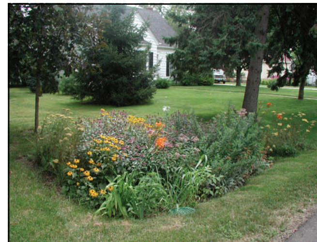
A rain garden example from the City of Maplewood, MN. Rain gardens provide native landscaping and attract wildlife.