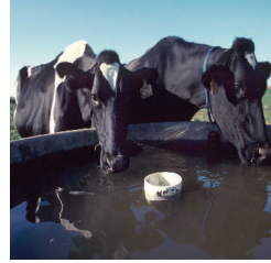
Alternative watering systems prevent livestock from accessing waterways. Tanks are one option.