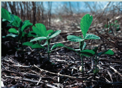
No-till soy beans. Conservation tillage reduces soil erosion and can help decrease fuel input due to fewer passes in the field.

A new cost-share program is now available for farmers in the Elkhart River Watershed, which includes parts of Elkhart, Kosciusko, LaGrange, and Noble counties. The program will provide financial assistance to farmers who are interested in installing conservation practices on their land. Eligible practices include manure management plans, exclusion fencing, rotational grazing, and many more. Applicants can receive up to 75 percent cost-share on approved practices.